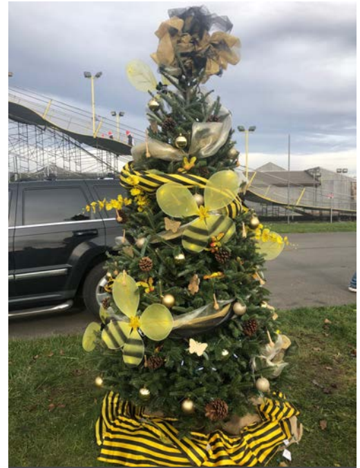
2020 Bee City sponsored tree at the Washington State Fair