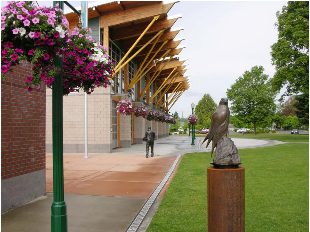
Flower hanging baskets in Downtown Puyallup - no longer treated with pesticides