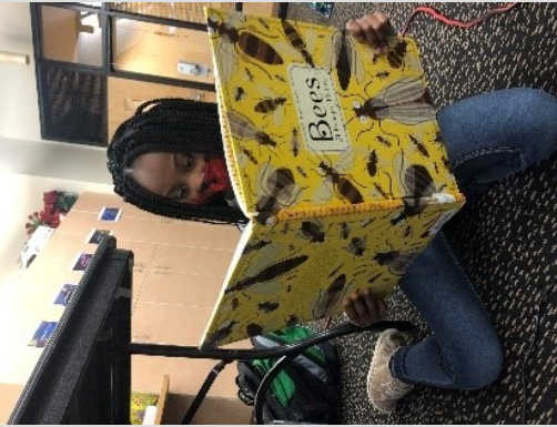
2020 PEAK Day Camp: Bee Week - student reading provided materials