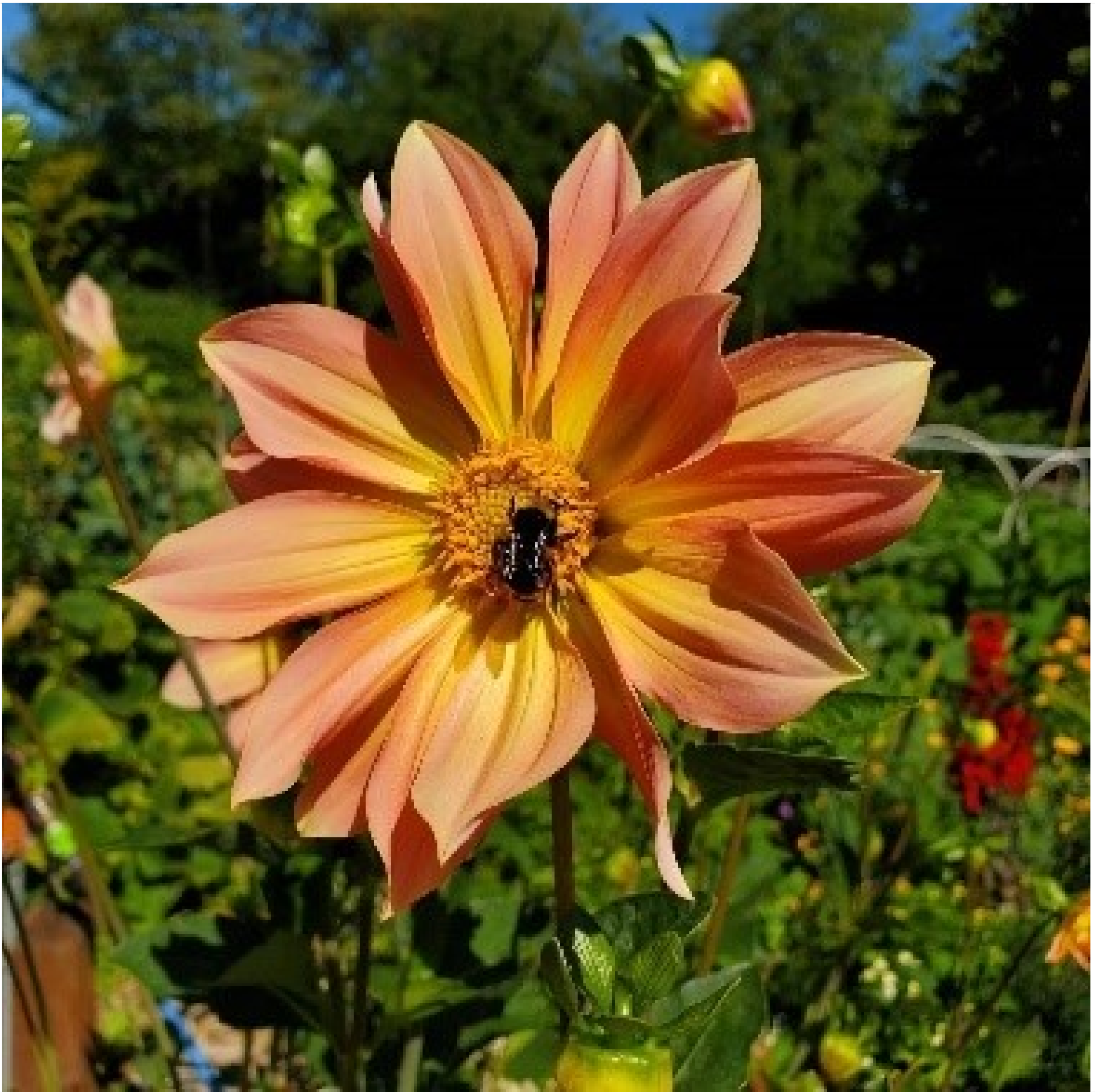
Puyallup Community Garden flower garden planting