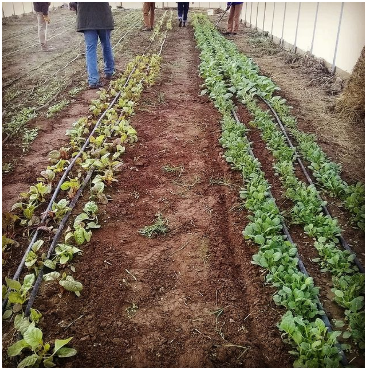
The Kenyon Farm has eliminated pesticide use except for targeted organic options in extreme cases