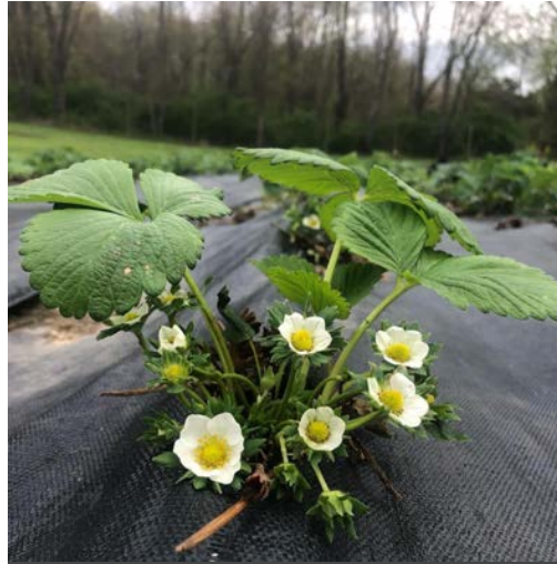
Strawberry at the Kenyon Farm