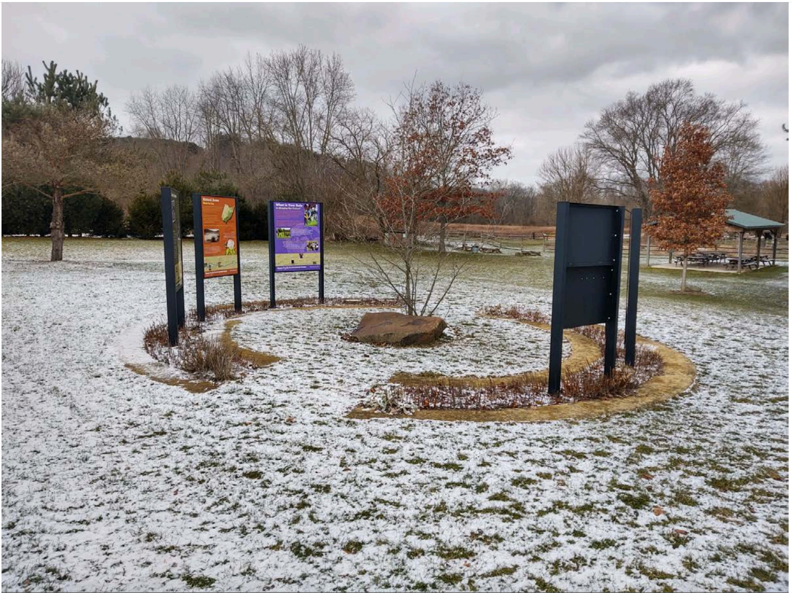
Interpretive signage includes information about Ohio pollinators as well as pollinator friendly plants during the growing season.