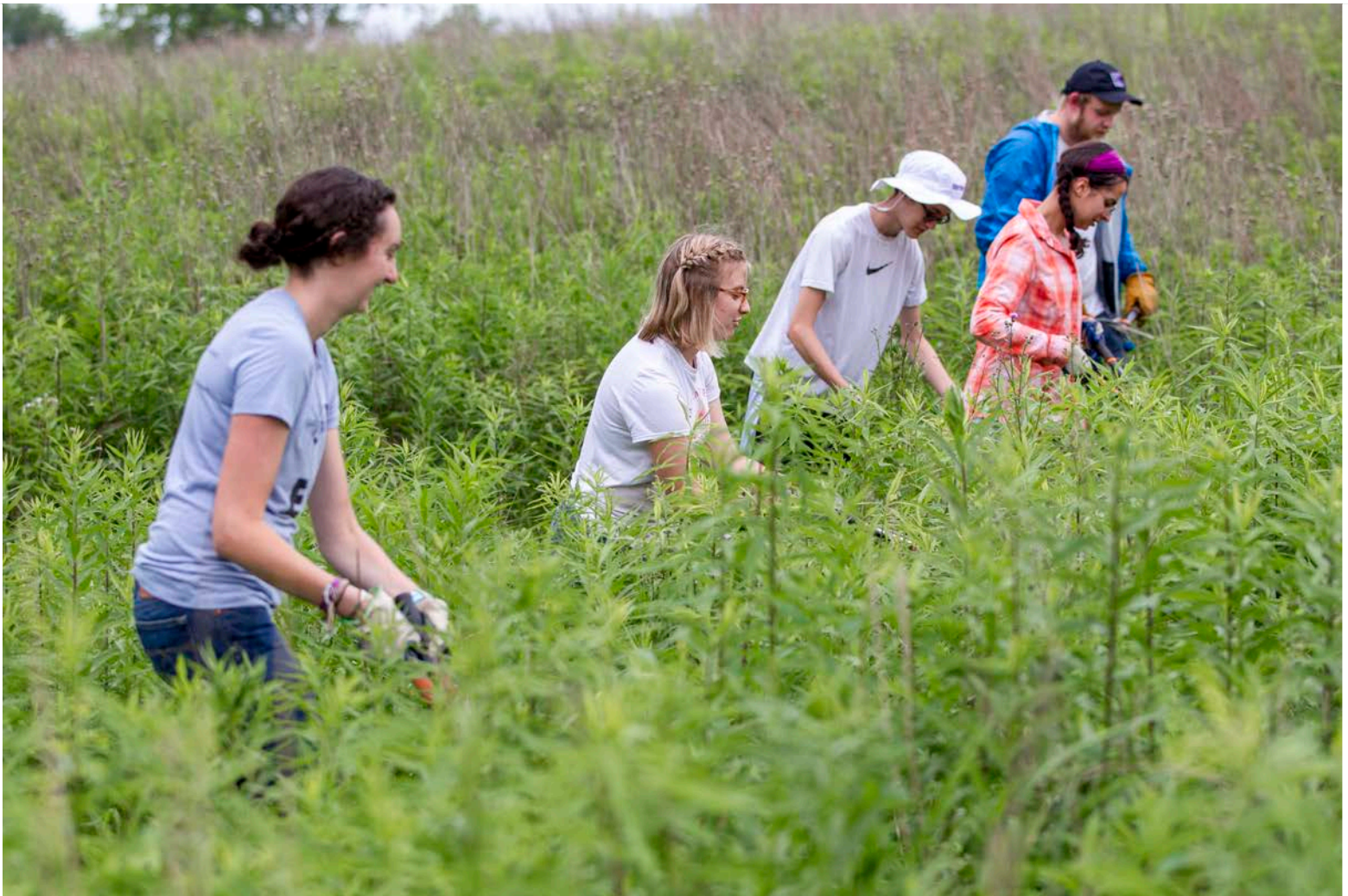
Removing thistle from a prairie before the flowering season