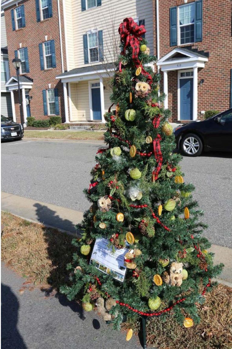
Pollinator Christmas Tree