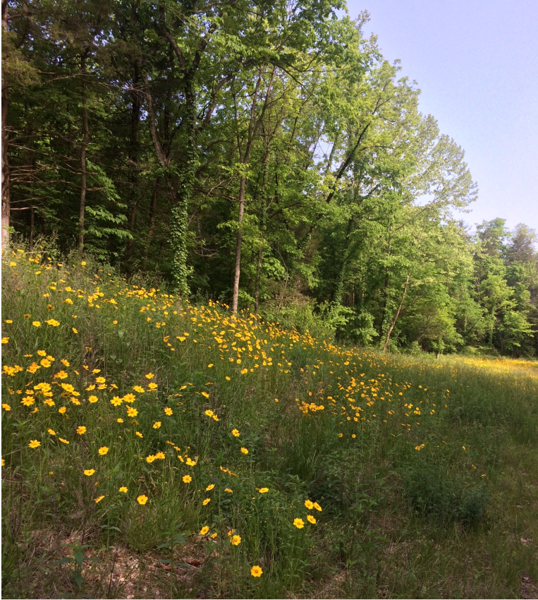
Early May 2020 on reclaimed right of way buried 30" & 36" water line on privately owned land.

Most of our habitat enhancement was accomplished at private yards, gardens and acreage. Our city also completed the start as a Mayors' Monarch Pledge City. As a result, the Parks Commission has committed to the creation of pollinator gardens in two of the city public parks with signage and habitat for native bees. Parks Commission has also provided for the start of 1000 milkweed plants.